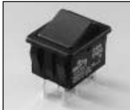
L4.82386.E Max pre-heat switch Max Vorglühschalter