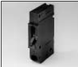
L4.82380.E Main circuit breaker Hauptschalter

NOTE: WHEN ORDERING QUOTE PART NUMBER BEMERKUNG: BEI BESTELLUNG IDENT.-NR. ANGEBEN