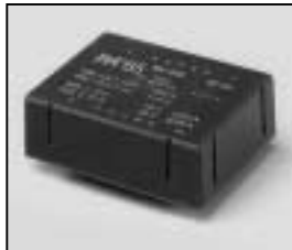
L4.82381.E Transformer BV 515 Transformator BV 515