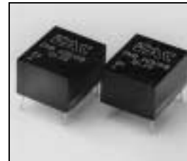
L4.82383.E Ignition Transformer (2 pieces) Zündübertrager (2 Stück)