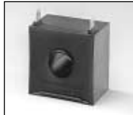
L4.82387.E Current probe Strommeßspule