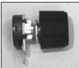
L4.82388.E Dimm pot with knob Dimmpotentiometer mit Drehknopf