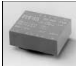
L4.82382.E Transformer BV 345 Transformator BV 345