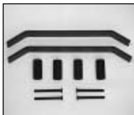
L4.82526.E Front handle-set cpl. Frontgriff-Set kpl.