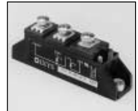
L4.82384.E Thyristor module Thyristormodul