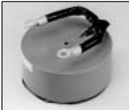
L4.82385.E HF-choke HF-Drossel