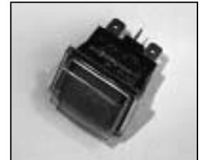
L4.82514.E Earth test switch Erdtaster